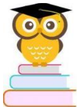
Key Stage Two Year Six