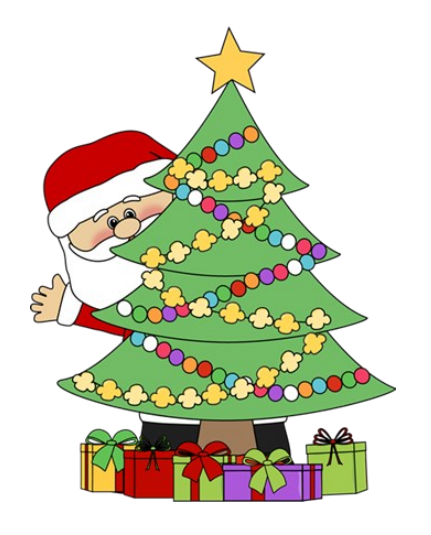
Christmas Dinner 12<sup>th</sup> December

The Holy Cross MAC are paying for everyone to have a Christmas dinner